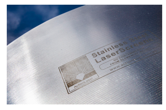
ActionLaser screens and filters are widely used in centrifuges and self cleaning filtration systems. Robust and hard wearing, optimising the life of the screens.